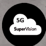
*ES stands for Energy Saving. To optimise the drying effect, all machines in the ES series can co-operate with each other through SuperVision 2.0.