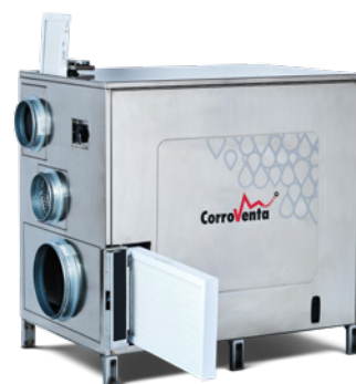
The dehumidifier's filter can be replaced quickly and easily through separate hatches. No need to disconnect ducts or remove service hatches.