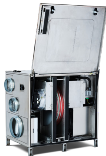
The hatch is kept closed by two compression locks and can be opened without any tools. This provides quick and easy access to the rotor and components.

Corroventa's machines can usually be recognised by their dominant red colour, however, we are now introducing our first stainless steel dehumidifier. The launch of A15 is a first step in Corroventa's vision to broaden the range of fixed dehumidification products. Despite not being red, the A15 is built, like all Corroventa machines, in Sweden, to the highest quality standards to provide a long service life and the ultimate performance!