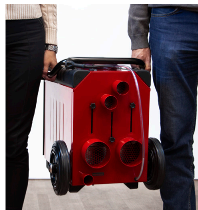
THE FOLDING HANDLE ON L4 HPW AND L4 ES HPW makes it possible for two people to carry the machine easily and acts as protection for the display and gauge.

All machines in the ES family are compatible with SuperVision®, and together create a system that is completely unique to the market. SuperVision® is used to control, measure and monitor the drying process via a computer, mobile phone or tablet.